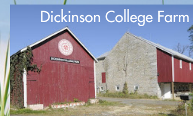
Dickinson College Farm

Field trip and guest speaker details will be posted to the program website as they are confirmed.